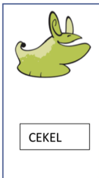
Fig. 1. Example of an item in the vocabulary learning test.

Vocabulary learning. This test was based on the vocabulary learning subtest of the Language Learning Aptitude for MA students (LLAMA; Rogers et al., 2017). Participants learned the names of a series of creatures and were told that they would be tested on them later. They were instructed not to take any notes during the test. Participants were presented with 20 pictures of novel creatures (selected from Romanova, 2015) paired with 20 novel words (e.g., CEKEL, as shown in Fig. 1) simultaneously on the screen and were given 2.5 min to memorize them. They then underwent two testing sessions – the first immediately after the learning phase. In the testing phase, all the creatures and names were displayed on the screen and participants were asked to drag and drop the names under the correct pictures within 3.5 min. Approximately 30 min later, at the end of the experimental session, they were tested again to assess delayed recall. We devised two parallel versions of the test using different creatures and novel words in each. Participants were randomly